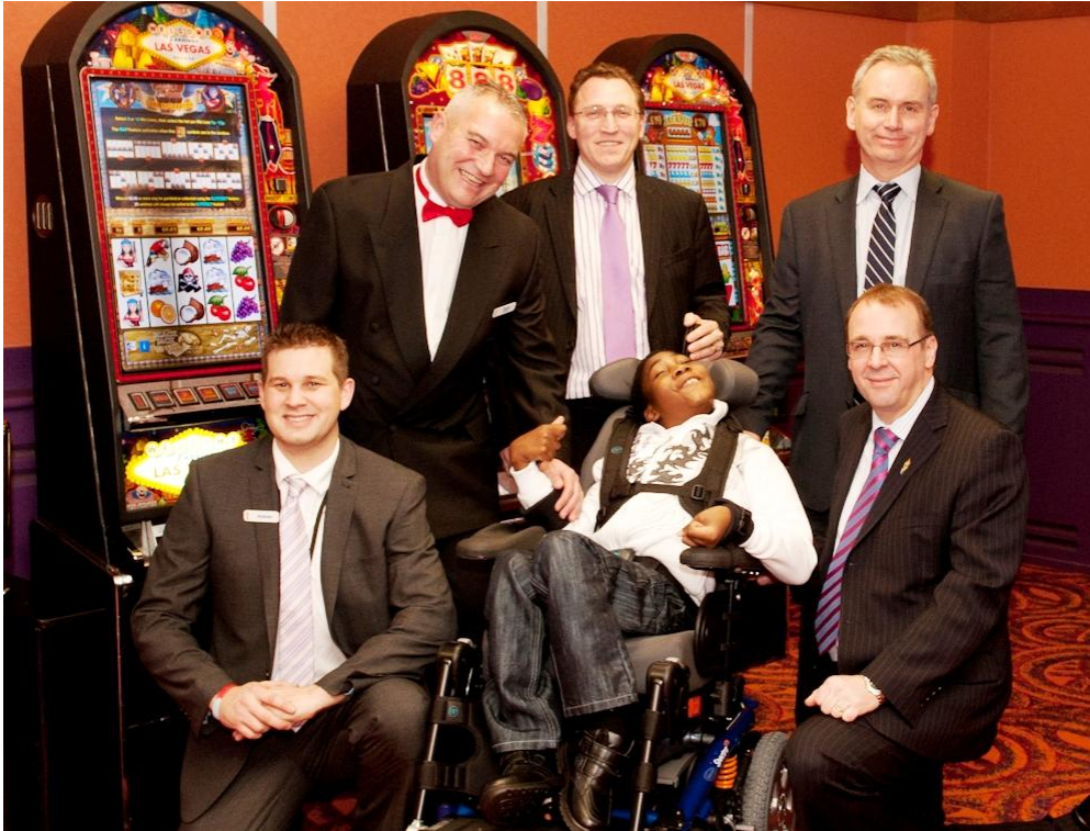
Beacon Bingo Loughborough