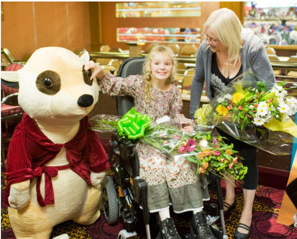
Beacon Bingo Northampton