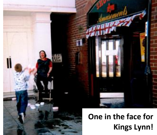
One in the face for Kings Lynn!